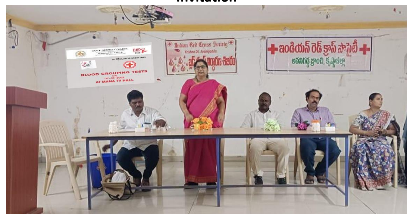
Principal opening remarks