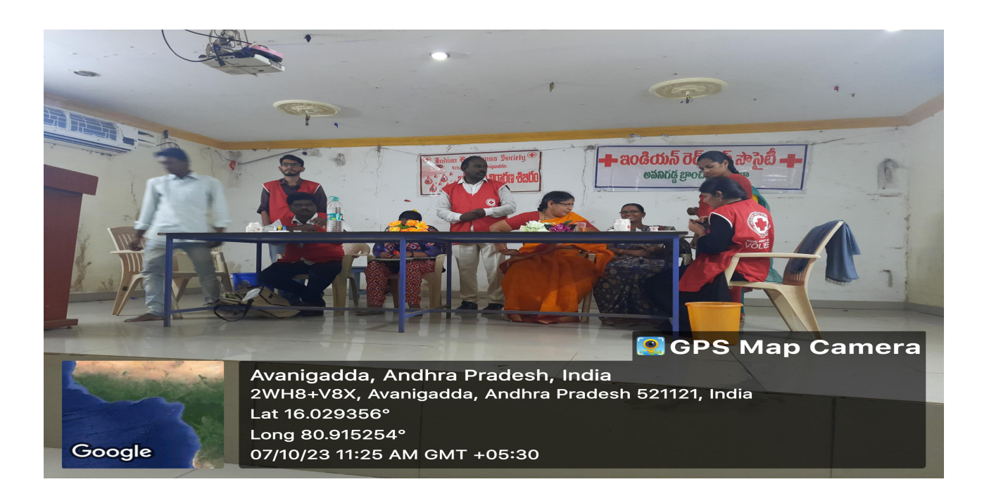
Blood grouping at MANA Tv HAll