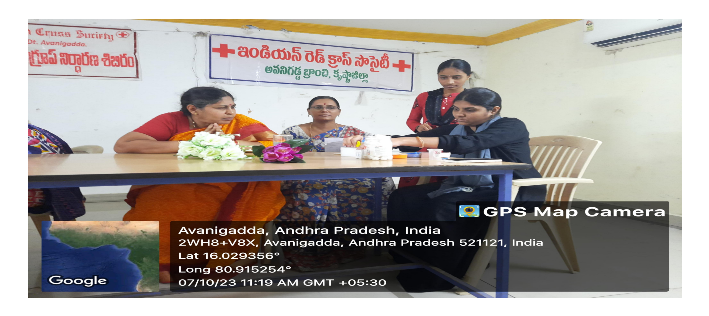
Blood grouping tests by IRCS technicians